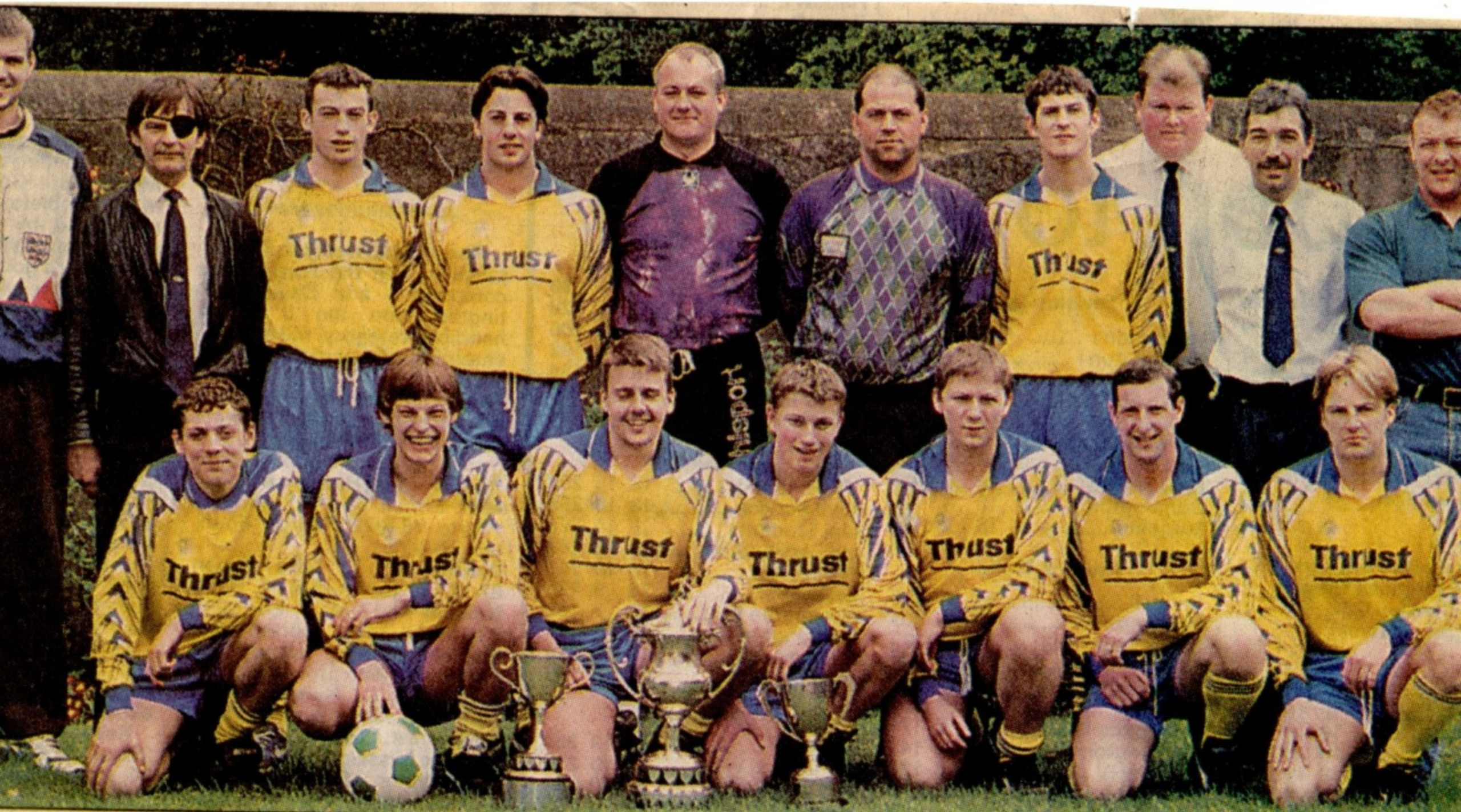
THE WINNERS - Bramham Football Club's Saturday first team, who won the Harrogate and Division One title, the League Cup and the Division One Cup. (W8098/c)