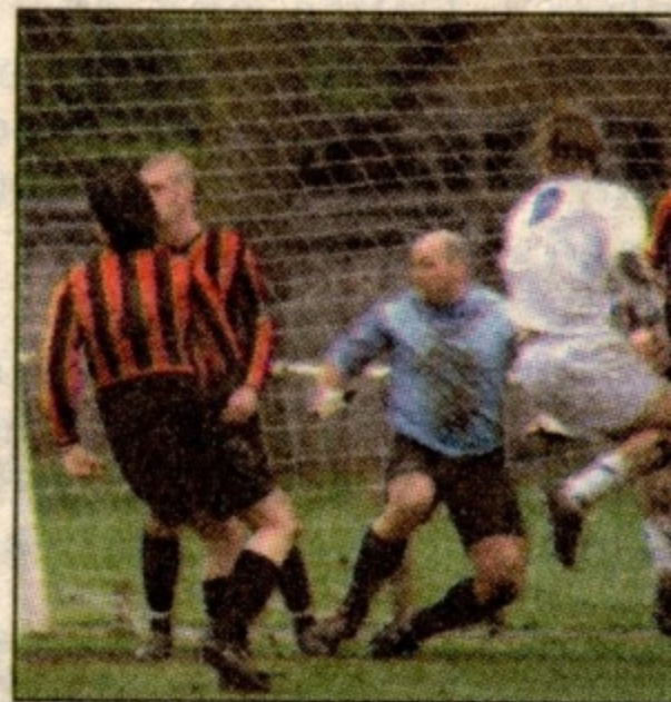
Action from Bramham Barkston Ash cup final against Sherburn White Rose at The Park: a flic kick causes mayhem in the goalmouth (2803052f).