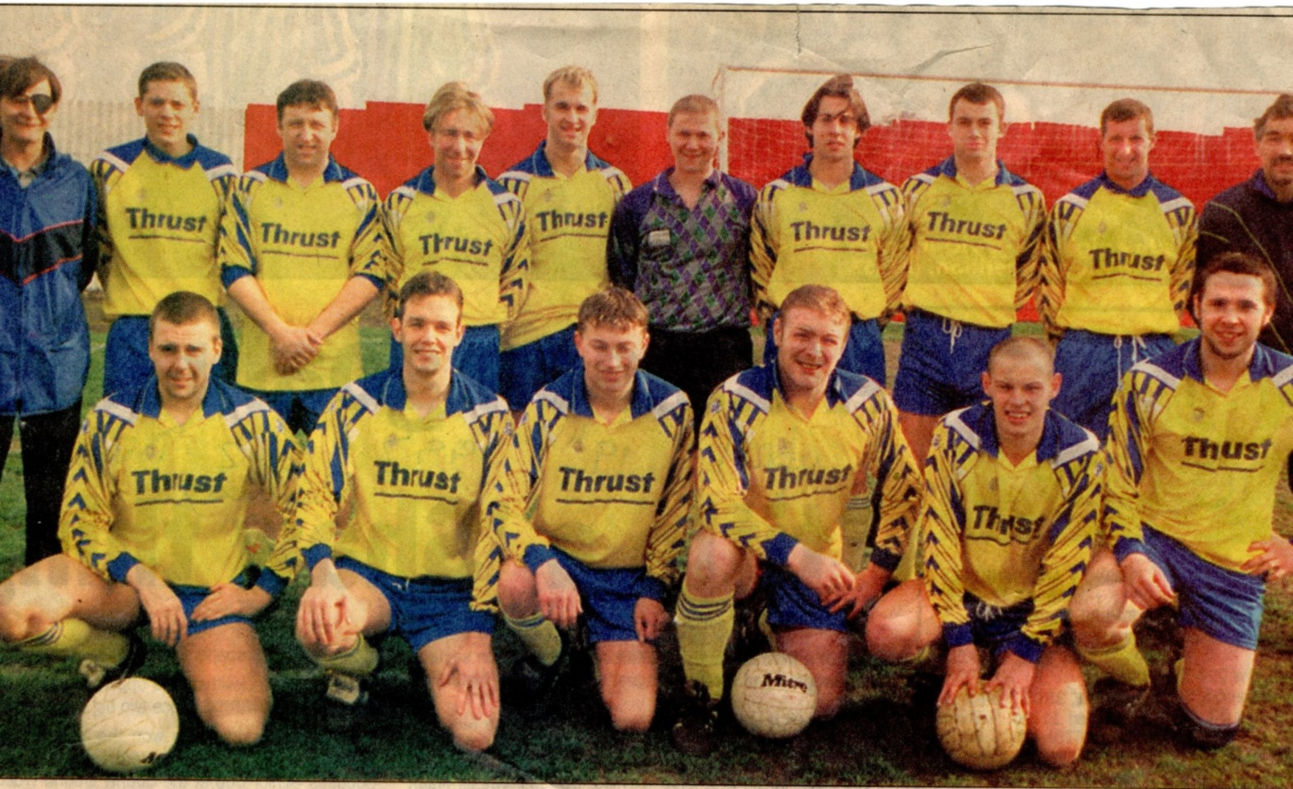
ED are Bramham Football Club, who are aiming to shoot down Beckwithshaw in the final of the Harrogate League's Challenge Cup tomorrow. Bramham secured their place in the showpiece with a semi-final success over their own Reserves last month. But they are certain to face a much sterner test when they take on Beckwithshaw, the town-owned Premier Division champions, at Station View, Starbeck. The match, which is sponsored by Ackrill Sports, kicks-off at 5.30pm. (A1075).