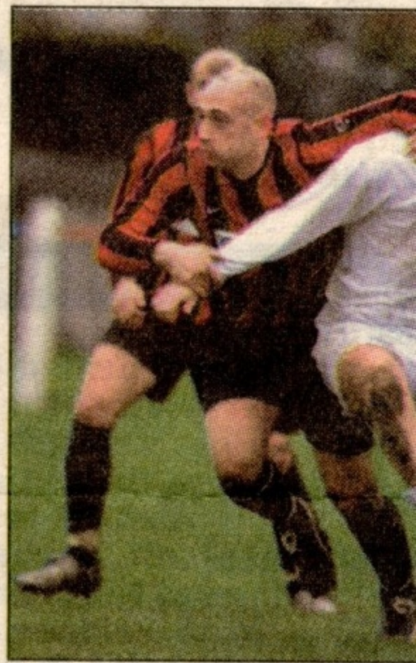
Action from the Barkston Ash cup final: left, a Bramham player gets past from his Sherburn opponent (2803052i); above, play is in a tussle for the ball (2803052i).

The day belonged to Bramham, though, and they will now be looking to continue their strong league form for the remainder of their season.